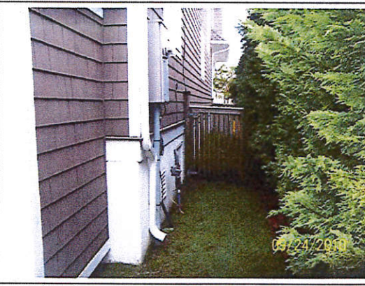
Left Side View – Date of Photograph: (See Photo Stamp)